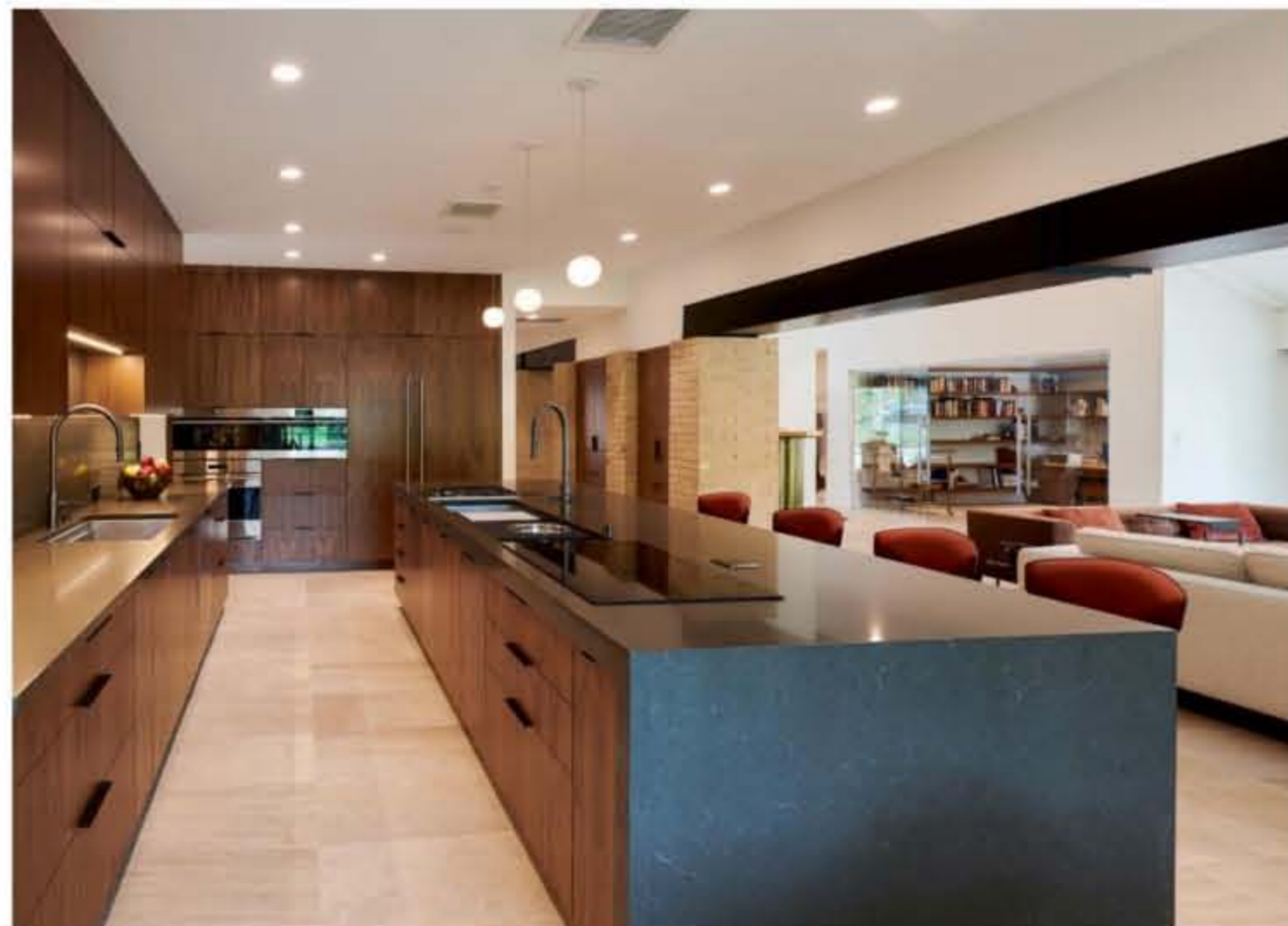
THE KITCHEN FEATURES WALNUT CABINETRY AND A DECIDEDLY MODERN DESIGN. THE ISLAND CHAIRS ARE FROM ITALY.