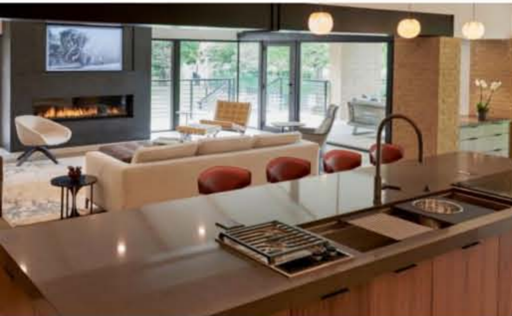
THE KITCHEN, DEFINED BY A DARK METAL BEAM AND FLANKING BRICK COLUMNS, BOASTS A GREAT VIEW OF THE LIVING ROOM AND LAKE BEHIND THE HOME.