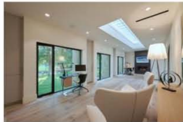
THIS HIGHLY FUNCTIONAL GALLERY SPACE SERVES MULTIPLE PURPOSES. IT IS HER OFFICE, EXERCISE AND CRAFT AREA, HIS ART STUDIO, AND EVEN THEIR OVERFLOW DINING SPACE FOR LARGE PARTIES. A 20-FOOT SKYLIGHT PROVIDES VARIED NATURAL LIGHT THROUGHOUT THE DAY.