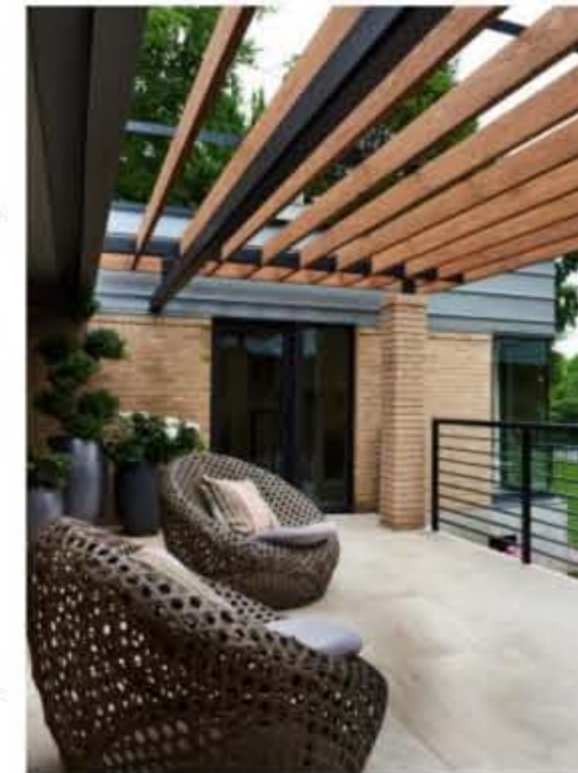
THE TRELLISED PATIO OUTSIDE THE MASTER SUITE OFFERS AMPLE VIEWS OF THE LAKE. INSIDE IS THE COUPLE'S READING ROOM.

Now they can't imagine living any place else.